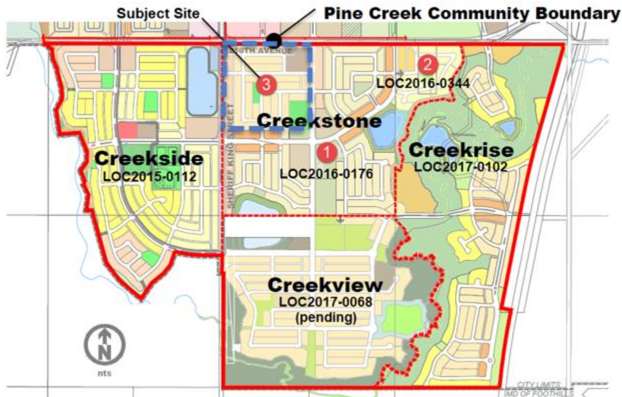
Figure 1: Pine Creek Community and Neighbourhoods

Previously approved and pending outline plan and land use amendment applications within the community of Pine Creek include: